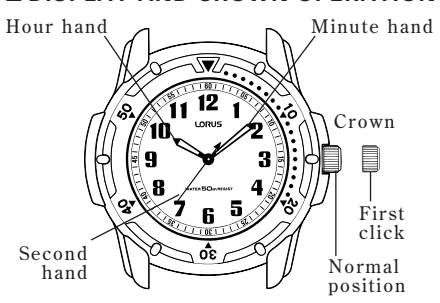
Crown: Setting the time at the first click.